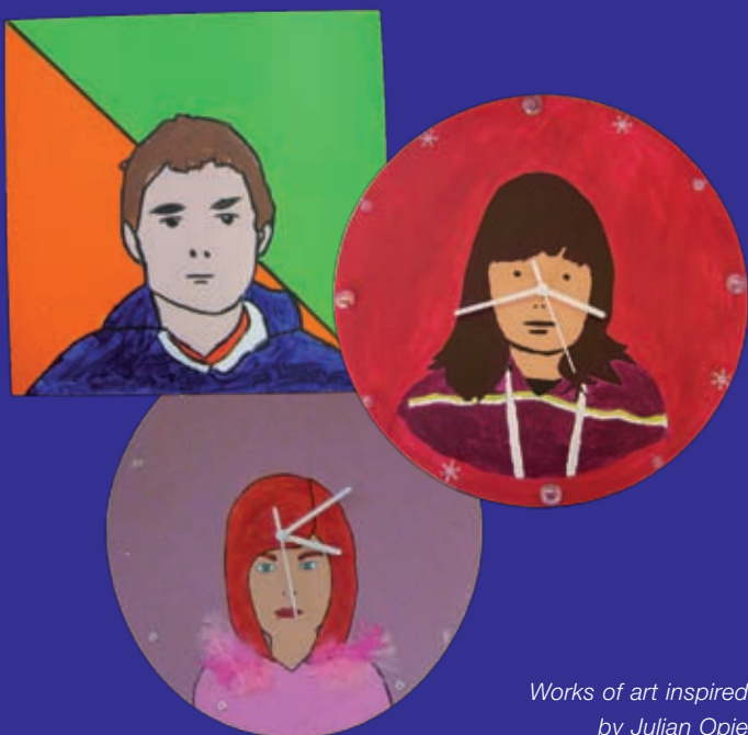
Works of art inspired by Julian Opie

"At The Art Room I am constantly made aware of the importance of the routine and the organisation that is vital in making the students feel secure. The projects that we work on incorporate literacy and numeracy and wherever possible we incorporate the National Curriculum. It is a pleasure to see how proud the students are of their work and how much they 'learn and achieve through art'"