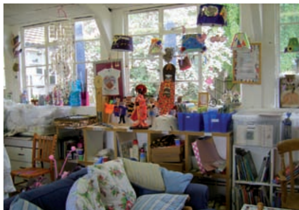
The Art Room at Oxford School