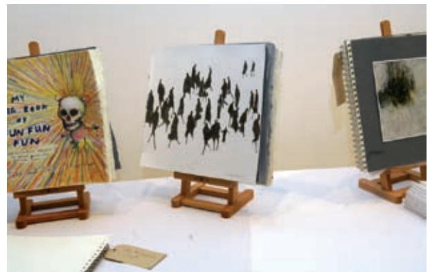
The Artists' sketchbooks for the 'Back to the Drawing Book' Auction